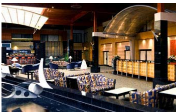
Sheraton Long Island

The 2007 Winter Program has been scheduled to be held January 4-7, 2007 at the Inn at Six Mountains, Killington, Vermont. This venue provides 5 hours of Continuing Education credits as well as some great networking. The Inn is located in the heart of Killington's night life and only one mile from the base lift. Rooms are spacious with breathtaking views of the stunning Vermont mountains. Brochures and registration forms will be mailed in November. For sponsorship opportunities please contact the Council office at 518-456-8819.