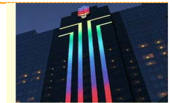
Seneca Niagara Hotel & Casino