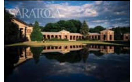
Saratoga Springs State Park