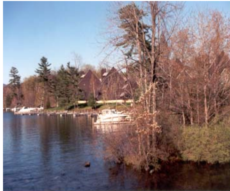
Bolton Landing, NY