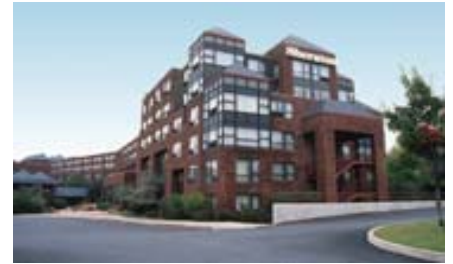
Saratoga Springs Convention Center

Convention Center in Saratoga Springs, NY April 15 – 17, 2005. Make sure you place the date on your calendar and register early to take advantage of the early bird rates. Please contact the Council office at (518) 456-8819 with any questions or to reserve your booth today.