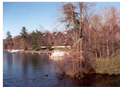
Lake George, May 4, 2002

To all Corporate Sponsors who made the 41st Annual Assembly a smashing success, the NYSCHP board of directors, 2002 Annual Assembly Committee and NYSCHP members thank you for your support!!!!!!