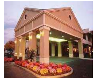
Holiday Inn Turf, Albany, NY