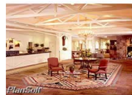
Rye Town Hilton, Rye, NY site of the 42nd Annual Assembly: May 2-4, 2003

Events marked with an asterisk have exhibiting opportunities for your companies!