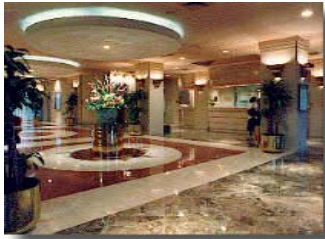
JFK Holiday Inn: site of the Oct. 6 Midyear Clinical Meeting.

Please make plans to join the NYSCHP this autumn for its annual Midyear Clinical Meetings. Two sites have been selected: Oct. 6 at the JFK Holiday Inn, Jamaica, NY and Oct. 20 at the Holiday Inn Turf, Albany, NY.