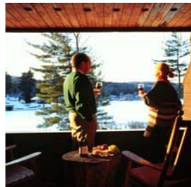
Sagamore Resort and Conference Center

If you haven't turned in your early bird reservation form, please do so. Twenty-three companies have already responded! The excitement is only just beginning!