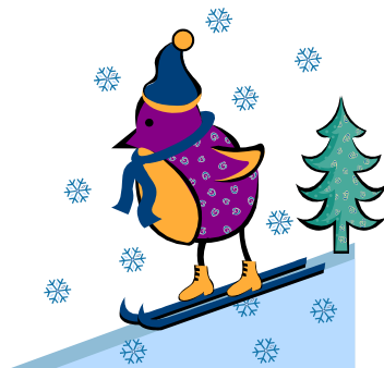
Winter Wonderland: Ski & CE The Inn of Six Mountains

Flyers will be mailed to everyone in October 2001! Watch your mail for details!