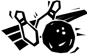
Midnight Bowling at the GameZone!

A bowling outing sponsored by Bayer, proved to be a tremendous success. This was the first offsite fun event other than golfing or softball and approximately 50 people were bussed to the bowling alley. The bowlers were high spirited and competitive but in a fun easy going way. Prizes were awarded for a number of dif-