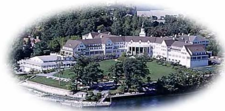
The Sagamore Resort and Spa located in Bolton Landing, New York on beautiful Lake George in the Adirondack Park.

I know that it's only Fall, and according to my watch it's still 2001, but it's never too early to keep in mind the wonderful opportunity you'll have at the New York State Council of Health-system Pharmacists 2002 Annual Assembly and Exhibit. There are a number of very important reasons for you to keep the Annual Assembly in mind: