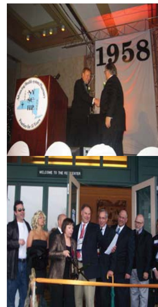
(Top) Awards Ceremony 2008 Annual Assembly